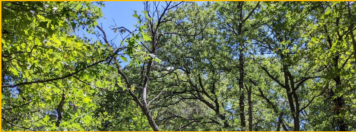
Closed canopy woodlands are targeted under Working Lands for Wildlife and EQIP's Cross Timbers Initiative.