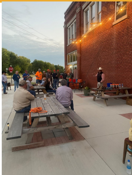
This photo was taken at the Bird dogs & brews event in Dewey, Oklahoma. I was able to talk to the event participants about upcoming hunting season answer any questions about bird biology.