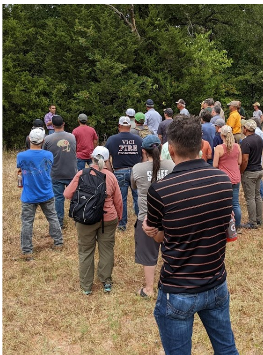
Prescribed Fire Field Day at Lexington WMA