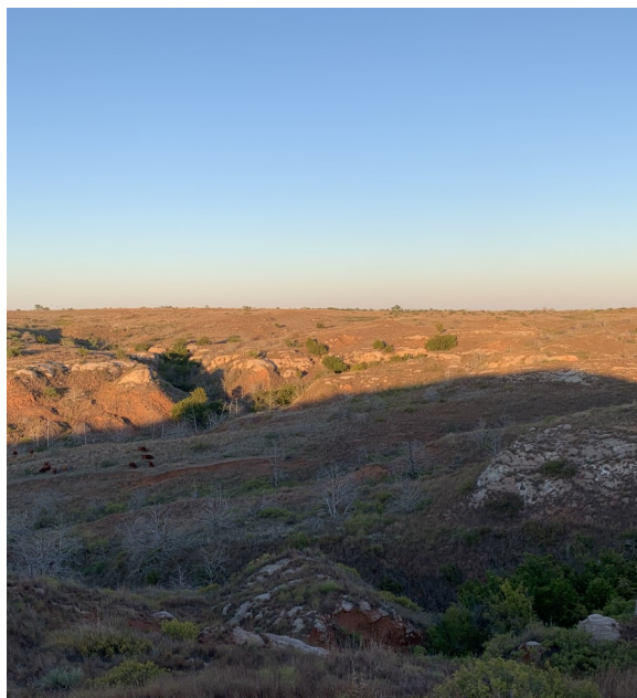
A GPGI prospective property along the Cimmaron River. These canyons are complex to burn, but are a lot of fun!

This quarter provided multiple opportunities for training and outreach. GPGI year 2 is a much anticipated program once again. With the constant fire season this year, and still being extremely dry going in to the dormant season, cedar removal is once again taking the spotlight of producers concerns. With fall EQIP coming up, we've begun the process of education, and getting applications to producers that need assistance for such practices.