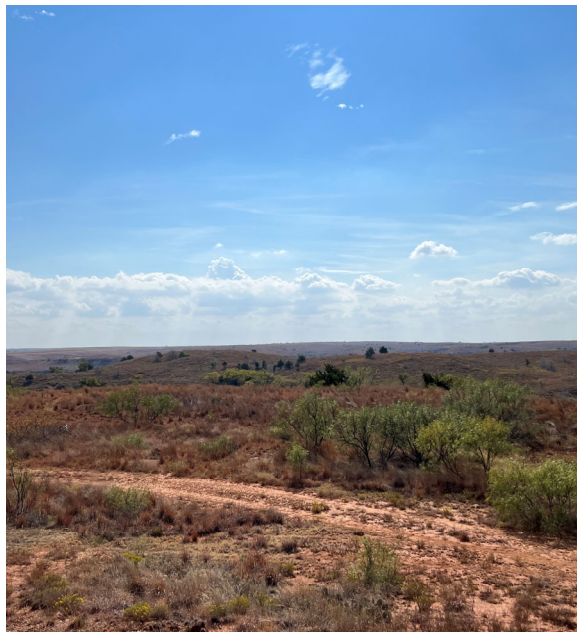
A GPGI prospective property along the Kansas line, across the state line on the OK line.

With COVID in the rear view mirror, getting back to in-person trainings and meetings. There has been a large addition to new field staff who needs field trainings before EQIP field evaluations start and seeing all the new faces on the team has been very enjoyable. Everyone is very eager to learn and quick to pick up new tools for their arsenal.