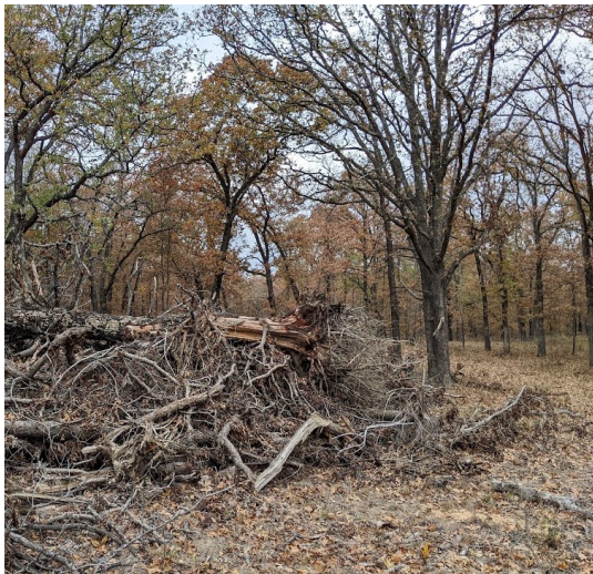
This producer was removing hardwoods and planting food plots before he learned that a natural food plot will plant itself with selective thinning.