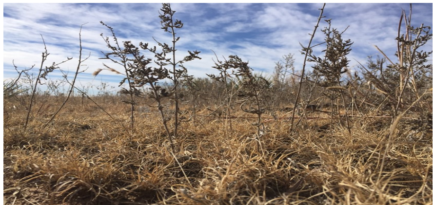
Harper county Range Health Assessment. Vegetation from a quail's perspective

Lek surveys started in mid-March. I'm will continue assisting ODWC with a couple routes in Harper County. I'm excited to say that I have heard a couple LPC so far and I hope to hear many more. As with all LPCI staff, vegetation monitoring is getting underway. I have several trips to Kansas planned to assist WAFWA and monitoring for LPCI in OK will keep me busy through the summer.