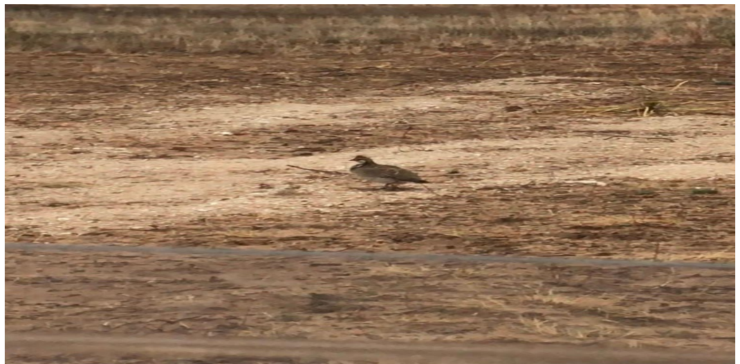
LEPC displaying on Leks in NM.