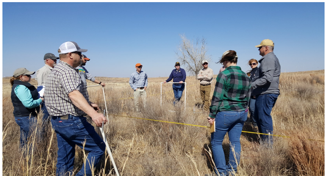
Going over vegetation transects out in the field during Woodward, OK training.

This last quarter has been working with landowners on EQIP applications on potential brush management, prescribe grazing and water infrastructure to enhance their management objectives out on the land. I am continuing to do field work conducting inventories and developing conservation plans