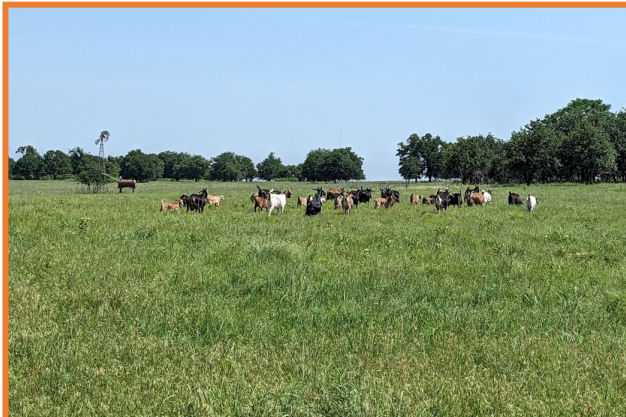
Goats have been a part of the management system for years on the Cross Timbers Experimental Research Station