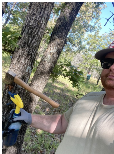
This photo was taken at the Big Bluestem QF Chapter Hands on Habitat Day at the Rock Creek Unit of the Osage WMA.