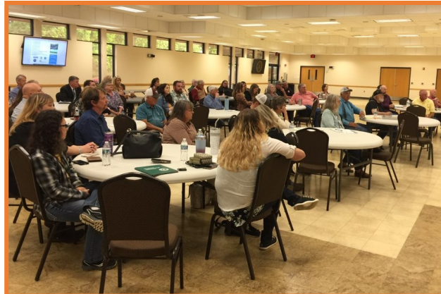
Participants learn about a variety of conservation programs at the Tribal Conservation Workshop in Ada.