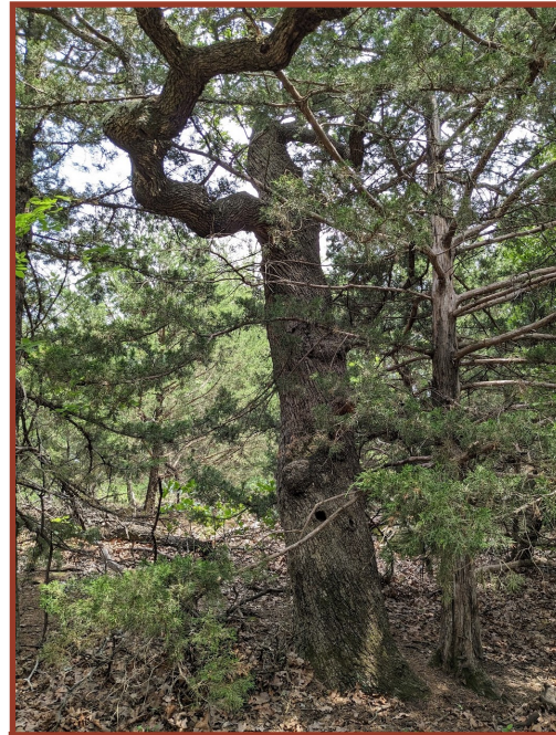
A great old post oak that could benefit from competition reduction (above).

Currently the NRCS State Biologist and I are planning another training in the SE/SC part of the state to help equip field office staff for a big year of conservation!