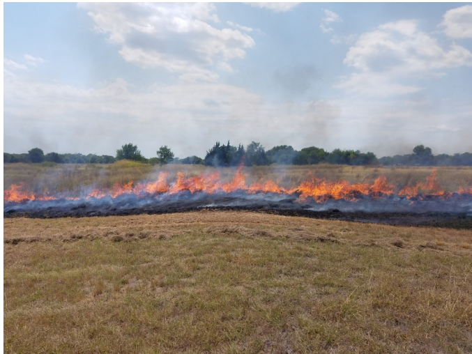
Photo from a growing season burn workshop hosted by Noble Research Institute near Marietta, OK. This was the 2nd of two burns conducted that day. Great opportunity to assist with and learn more about growing season burns and the benefits that can come from them. Fire behavior between the two burn units were quite different even though the sites were less than 10 miles apart.