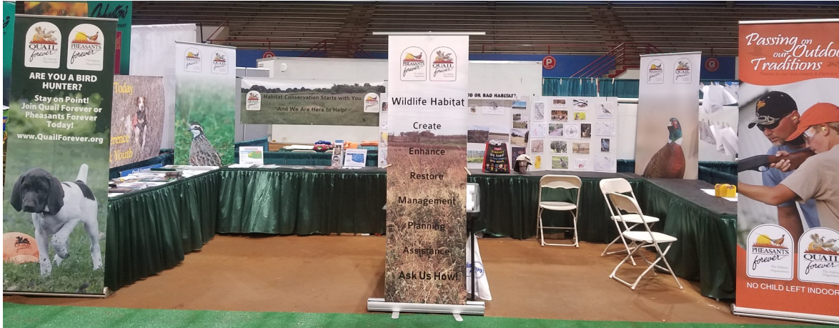
Photo: PF/QF booth at ODWC's Wildlife Expo 2018