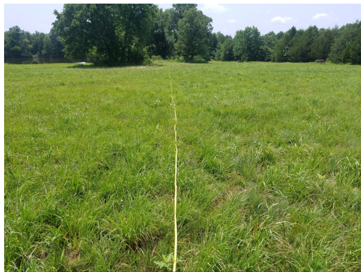
Photo: Monarch WHEG transect in Wagoner County