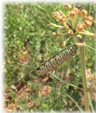
I found this fella on plains milkweed while conducting a follow-up WHEG on a Monarch contract.

In the beginning of August, I was honored to participate in a Growing Season Prescribed Fire Field Day hosted by the Noble Research Institute. There is no better teacher than experience and the field day provided it! Participants were able to assist on two burns totaling 54 acres. The burns were very different and showed just how important fuel composition and fuel moisture are when planning a burn. The afternoon burn acted like a dormant season fire because of the hot temperatures and low fuel moisture. Overall, it was a very educational day in the field and I hope to use that knowledge to encourage others to implement growing season burns.