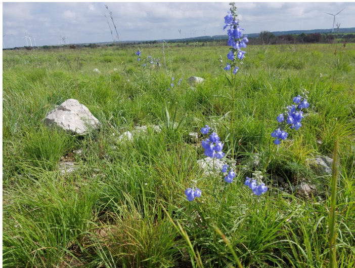
Photo from attending the Great Plains Fire Summit in Ardmore, OK in early October. This particular area was burned the previous spring and is clearly showing the benefits; flowering plants expressing themselves and great livestock forage. You can identify the blue sage in the foreground, but there are many more flowers in the background along with some woody skeletons.