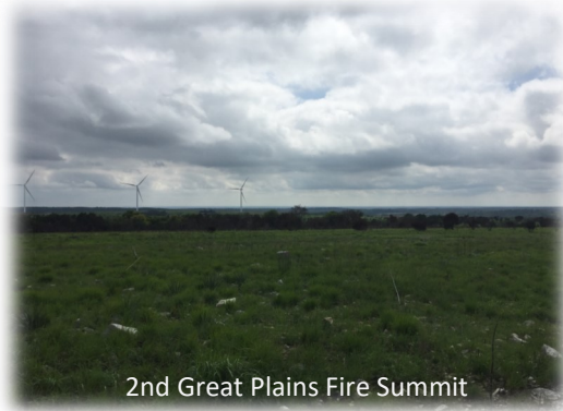
2nd Great Plains Fire Summit