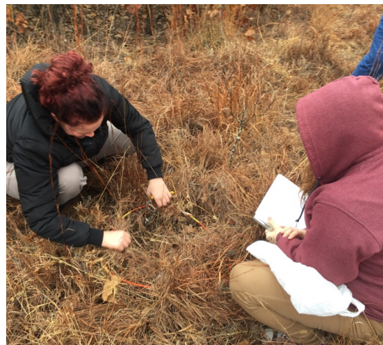
This photo is from the field of an Osage County, OK producer. We were conducting a dry weight rank for a Rangeland Health Evaluation.

Over the past three months I have learned so much from everyone around me. I have been working with NRCS to train on Pasture and Range Health Assessments. I am becoming more familiar with the inventory process, which incorporates the use of grazing tools such as NRCS GrazeCalc, pasture sticks, and dry weight rank to help evaluate the individual site conditions. I am currently working towards my NRCS apprentice level certifications for Conservation Planners. This includes prescribed burn certification. Once I have finished the final step of writing a complete burn plan; I will be able to help plan and participate in local burns. I am excited to help landowners integrate fire onto their landscape.