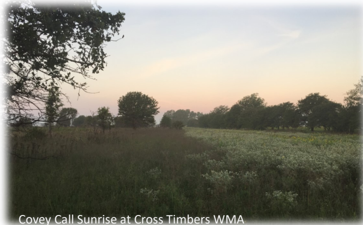
Covey Call Sunrise at Cross Timbers WMA