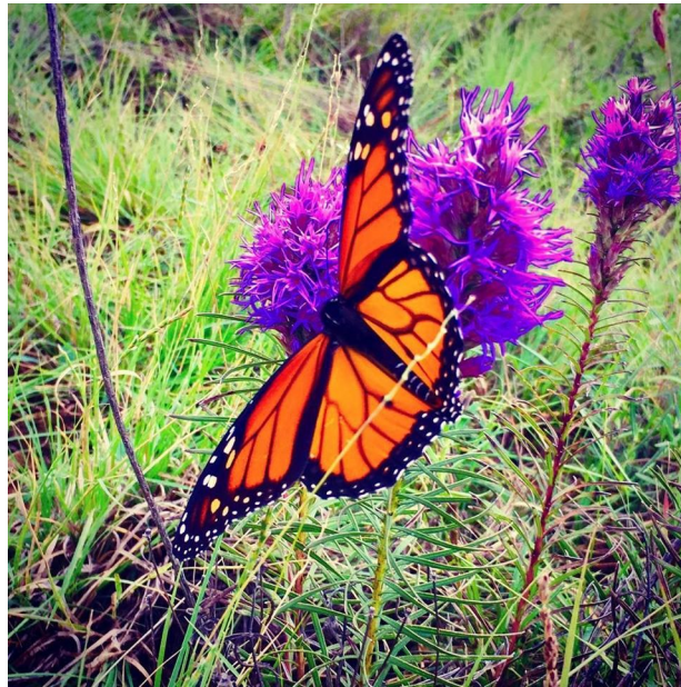
I observed this Monarch feeding on Tall Blazing Star while conducting quail habitat surveys.

With that in mind, each project takes precise planning, implementation, and constant evaluation to provide and maintain high quality habitat and management. In the first couple months since my hiring, I have already begun providing landowners technical assistance for those exact stages of wildlife habitat conservation. Whether it is establishing a watering source, conducting grazing plan evaluations, monitoring a CRP field during mid-contract management, these projects all go through the conservation planning process. This quarter, I have conducted several site visits with landowners to discuss possible plans, assisted with grazing plan plant species inventories, as well as meeting with landowners to discuss ways to make their properties both cattle and wildlife friendly. As winter turns to spring, more prescribed fire will be put on the ground to enhance habitats across the landscape.