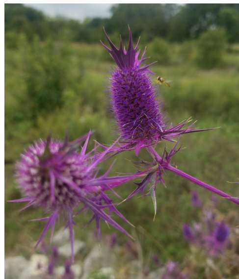
Hoverfly nectaring on Leavenworth's eryngo

Late November I found myself in Nebraska at a Monarch Conservation Partners Meeting, which provided the opportunity to meet and network with many different organizations working on monarch/pollinator conservation. On the front end of this meeting, PF/QF coordinated a meeting with NFWF and NRCS, across 8 states, to discuss the current status of the Monarch RCPP and plans moving into FY2019.