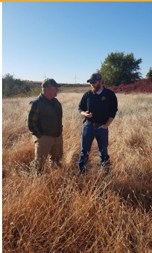
Photo: Taken in November, during a site visit where the landowner wants to convert Old World Bluestem to natives for wildlife habitat.

Many of the landowners I have been in contact with recently all have a similar tune: "what's happening to all my quail?" Folks are concerned about not seeing birds and are becoming eager to do what they can on their properties. Eastern Red Cedar still plague our landscapes, and landowners are increasingly motivated to remove them and return the landscapes to a healthy prairie once again. Removing these trees are going to play a crucial role in the upcoming years for many grassland species such as quail, turkey and prairie chickens. I am hopeful that between EQIP and the new CRP signups this year we can make a dent in these trees, providing more quality habitat and balanced grazing systems that will work for both ranchers and wildlife.