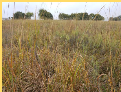
Bermuda Conversion to Natives