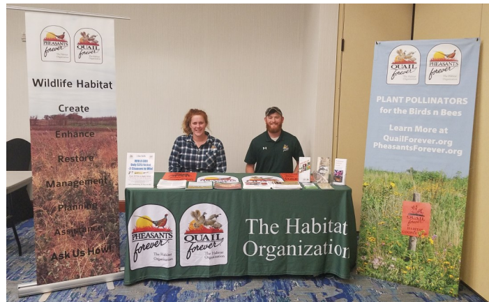
Photo: Booth setup and ready for the 33rd Prairie Grouse Technical Council meeting in Bartlesville, OK.