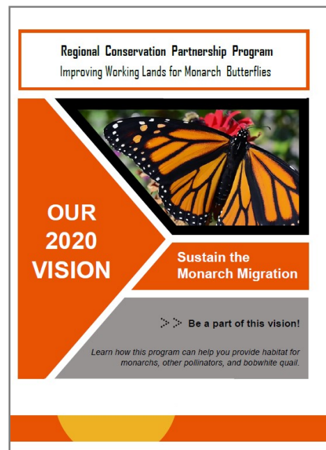
The 2020 Monarch RCPP aims to restore or enhance monarch butterfly habitat in Oklahoma

To this end, I have created a brochure that provides an overview of the program to share at meetings and during visits. I am hopeful that landowners will take these to share with neighbors. In this way it will be a powerful tool to help spread the word about the program.