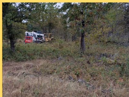
Mechanical Tree Removal