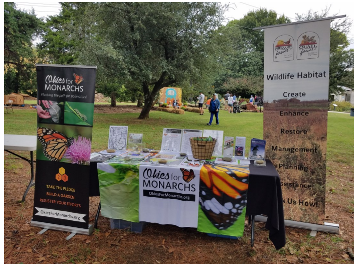
Photo: Taken at OSU Botanic Gardens during Garden Fest. Pollinators, birds, and grazing!