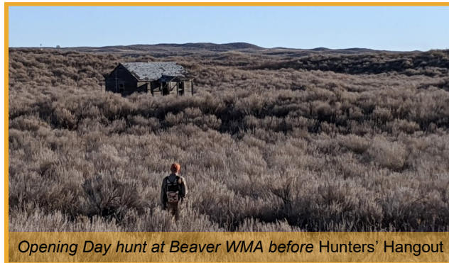
Opening Day hunt at Beaver WMA before Hunters' Hangout