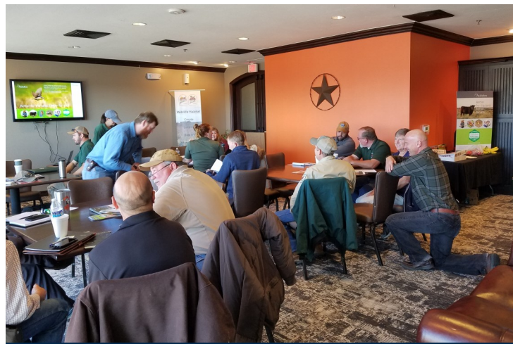
Photo: Taken at the Audubon Conservation Ranching OK Kickoff Meeting in Stillwater, OK.

In addition, our Oklahoma Quail Forever Team has been busy working out details for our upcoming State Meeting, which will take place February 28-29, 2020 in Oklahoma City. Our State Meeting will feature great speakers, food, and fun. Be sure to mark your calendars!