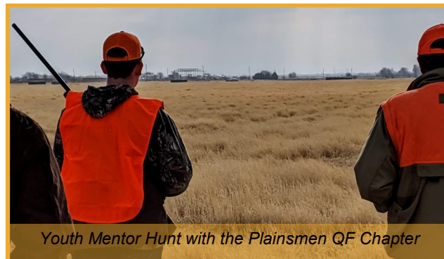
Youth Mentor Hunt with the Plainsmen QF Chapter