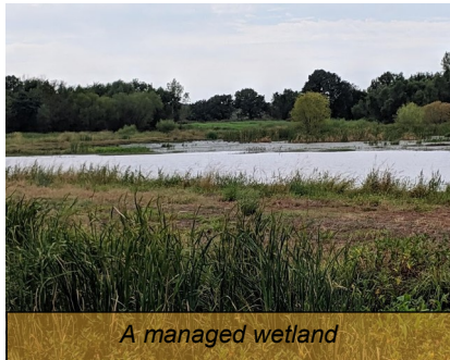
A managed wetland