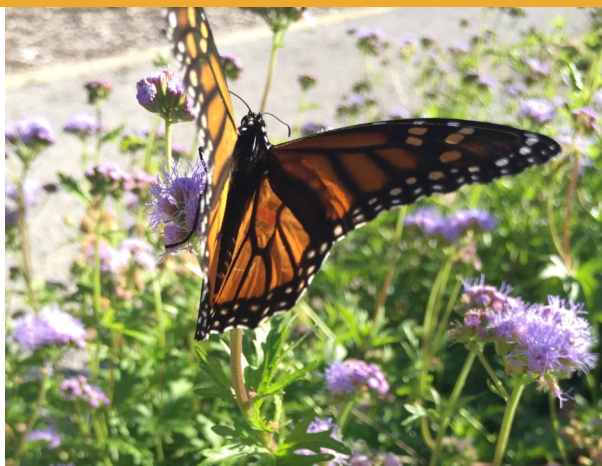
These pictures were taken October 15, 2019 at Woodward Park in Tulsa, OK