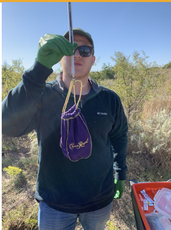
Photo: Taken in October while trapping quail at Cooper WMA. A member of SCWDS is weighing a captured Bobwhite Quail.