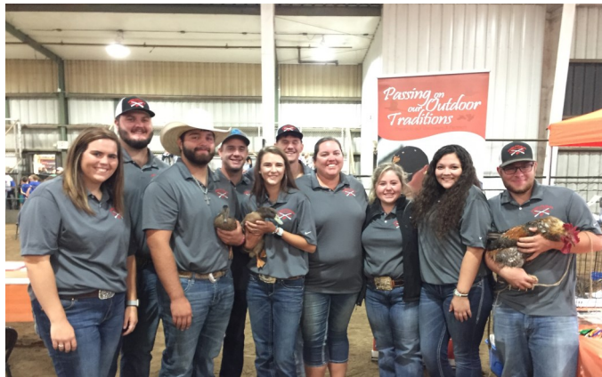
Connors State College Quail Forever Chapter members at the Fall on the Farm Day– October 15, 2019