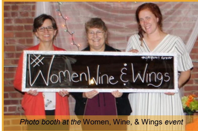
Photo booth at the Women, Wine, & Wings event