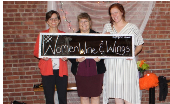
This photo was taken October 16, 2019 of the OK QF staff at the Women, Wine & Wings Event

On October 16, 2019 at the Cabin Boys Brewery in Tulsa, OK Quail Forever hosted our inaugural Women, Wine & Wings event. This event brought together women leaders in conservation from across the state to share their knowledge and experiences with local women interested in urban and rural conservation. It was a night that allowed women to mingle with new people, expand their knowledge, and enjoy some good food and drinks!