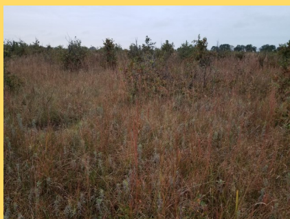
NBCI Quail Point