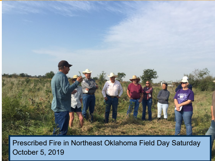
Prescribed Fire in Northeast Oklahoma Field Day Saturday October 5, 2019