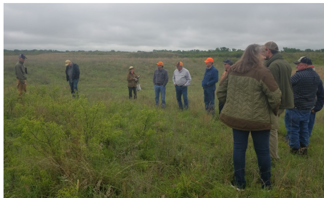
Photo: First stop at Groendyke Ranch for landowner field day.