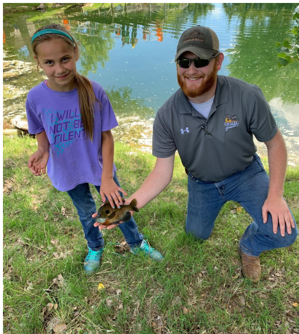
This photo was taken June 7th at the Beaver Field Day. 4H kids gathered for a day filled with pollinator planting, fishing, and other outdoors activities.