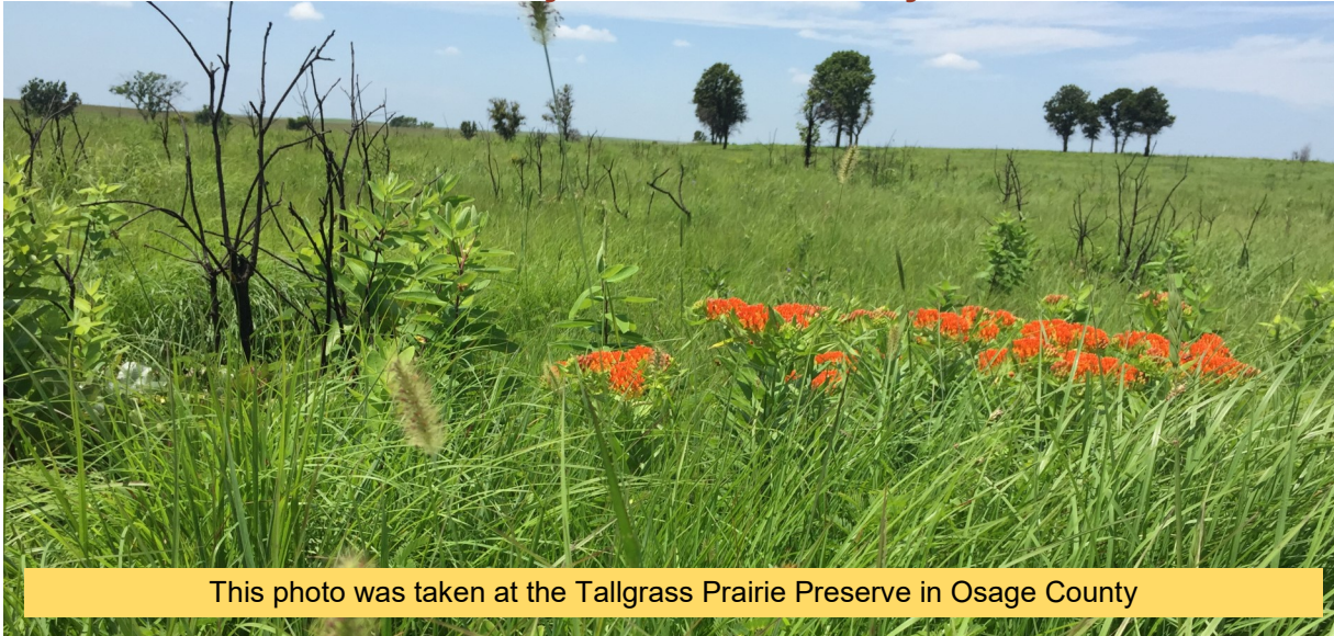
This photo was taken at the Tallgrass Prairie Preserve in Osage County