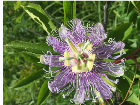
Passion Flower in June Photo from OSU Research Range outside Stillwater, OK

My new favorite past time is learning new species of flowers. I often come back from the field with 20 new pictures and a hand full of specimens to identify and press. I have to stop myself from pulling over on the side of the road to go pick flowers I don't know. I love figuring out which forb it is and the benefits they provide to wildlife. I am looking forward to this summer to add to my collection.