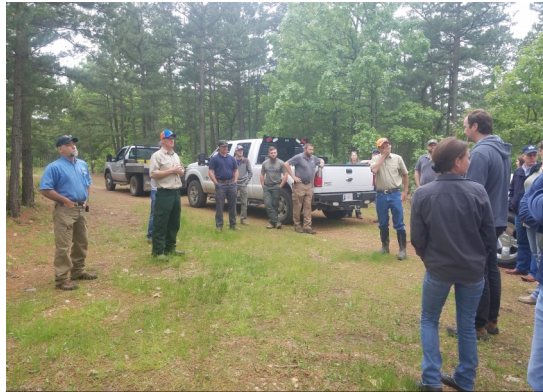
Photo: First stop at Spavinaw WMA Field Day.