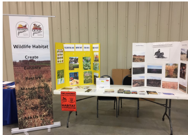
This photo was taken during the Craig and Ottawa Counties Trade Show in April, 2019