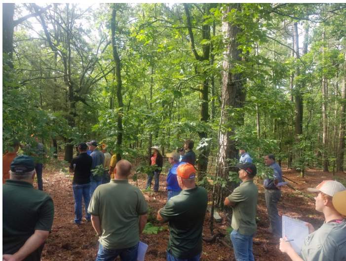
Photo taken during Pushmataha WMA Field Day. This is one of the forest research plots on the WMA showcasing the results from different management techniques. You can walk along a road, lined with research plots, and get a great visual of management results and then implement these management techniques to achieve your personal goals and objectives for your property.