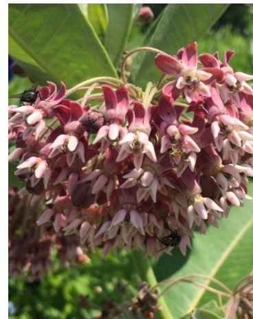
Common Milkweed in June from The Tallgrass Prairie Preserve in Osage County